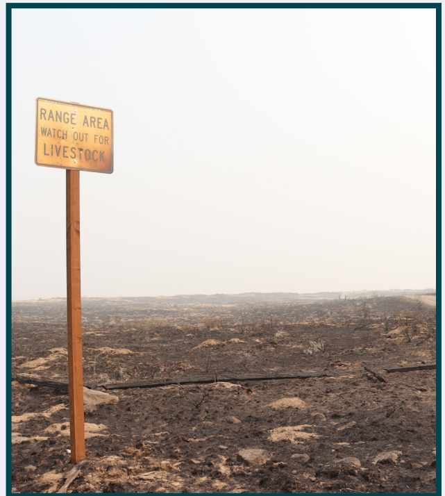
Damage caused by the Whitney Fire in Lincoln County.

FSA disaster assistance programs cover a breadth of landowner needs post-fire, including forage and grazing, livestock mortality, financial support, and farmland damage.