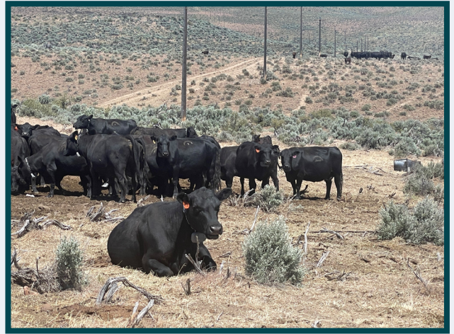
Cows wearing virtual fence collars in the Kittitas Valley.

Washington has begun piloting virtual fencing projects as an alternative option to rebuilding fence after a fire. Virtual fencing , which uses satellite-connected collars, allows ranchers to have more flexibility to exclude burned and other sensitive areas from grazing without replacing expensive fencing.